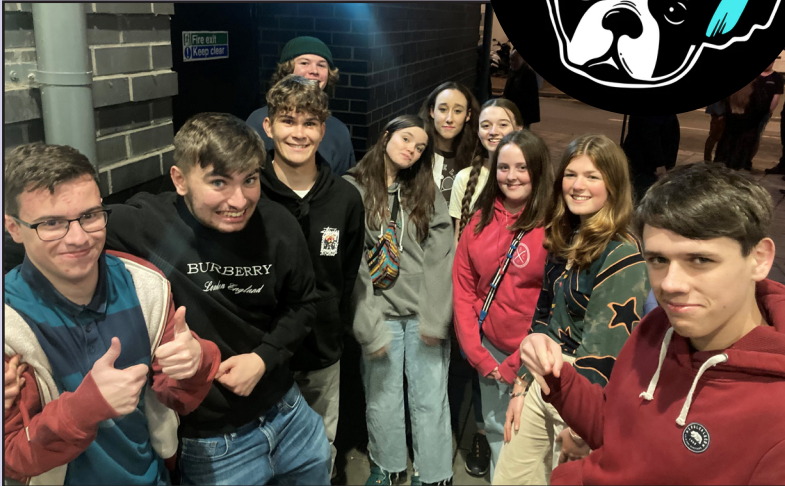
Excited music students about to see Snarky Puppy