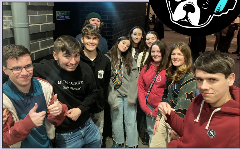
Excited music students about to see Snarky Puppy